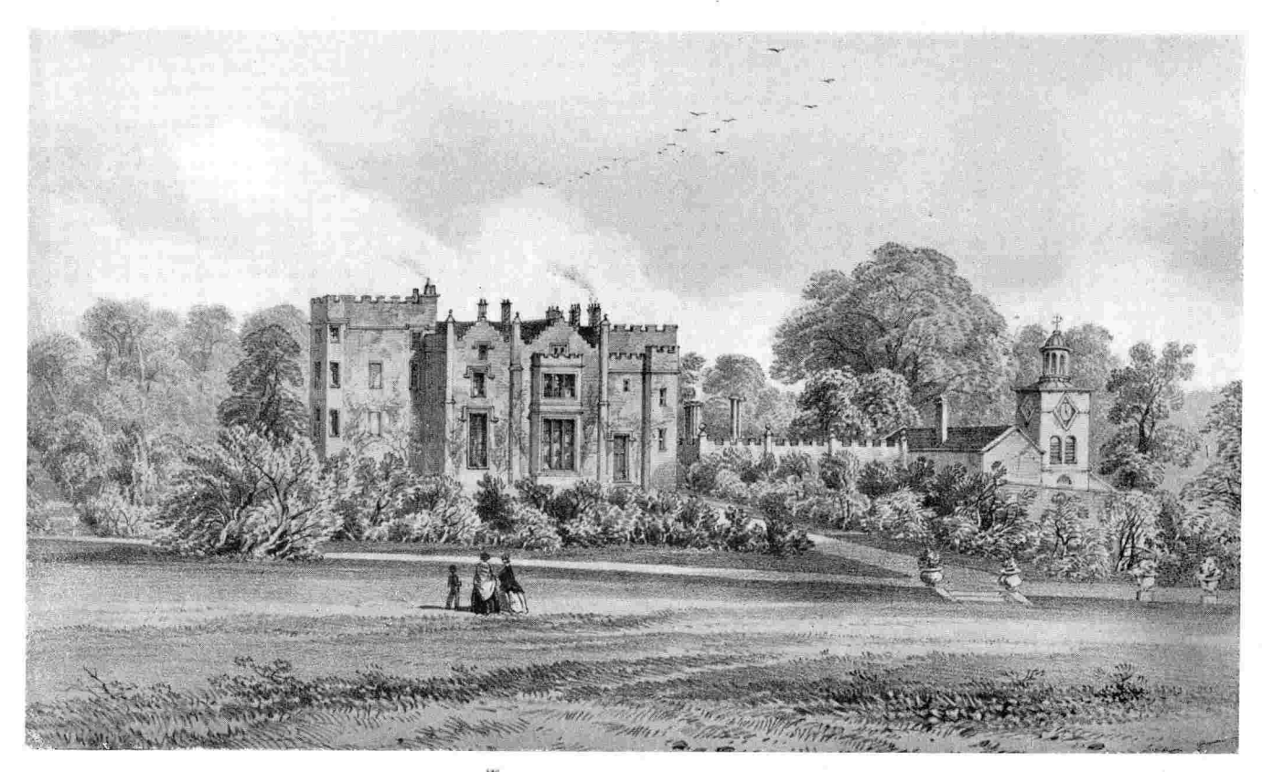
Brome Hall, about 1840.