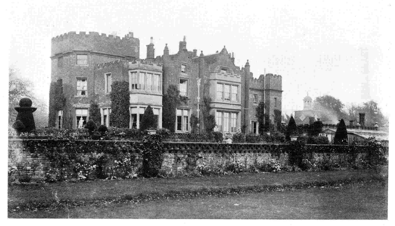
BROME HALL. The Seat of LADY BATEMAN, 1911.